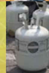
Ozone Depleting Substances